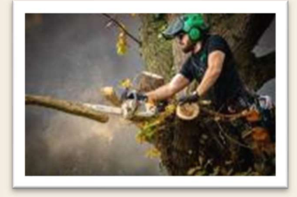
"Tree felling" Trish Bloodworth 3<sup>rd</sup> place group A

The culmination of the evening was the members vote for My Stroud – but this has its own section