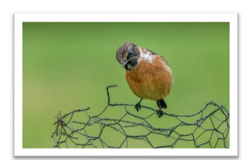
Jeff Kirby's stonechat shared via our SCC FaceBook Page