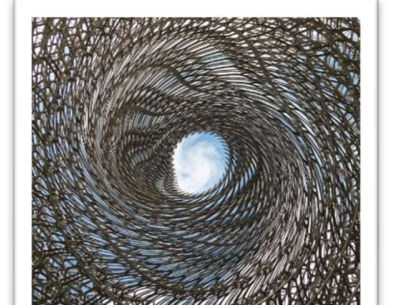
Jane Bodkin Highly commended group B

February competition is MONOCHROME Next deadline is 11th February